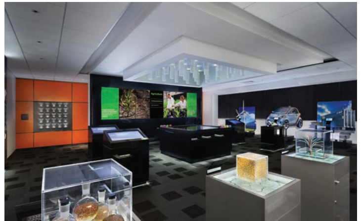
The Innovation Center at BASF's NA headquarters showcases BASF chemistry that goes into products ranging from agriculture, automotive, consumer goods and construction materials.

can achieve. By achieving LEED Double Platinum, the building became the first and largest office building in New Jersey with this certification. BASF's participation in the technically rigorous LEED process was voluntary and our chemistry went into the new building to ensure that building materials are sustainable, environmentally responsible and contribute to energy efficiency, durability, indoor air quality and human comfort.